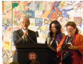
Introduction of Regional Leaders and key volunteers