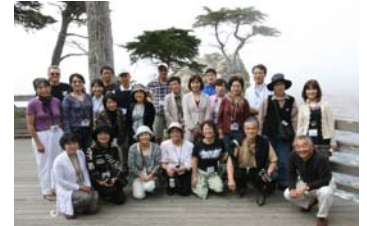
Monterey, Carmel, Salinas Tour