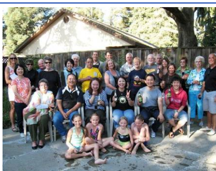
11. Gilroy (5)