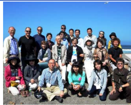
2. Sonoma County (17)