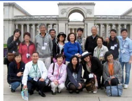
9. Japanese American Experience(17)