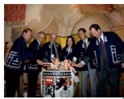
Breaking of the ceremonial sake barrel *