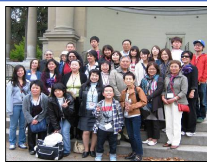
8-A. San Francisco County A (21)