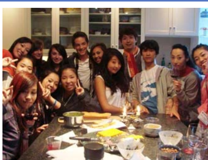
8-C. San Francisco County C (10)