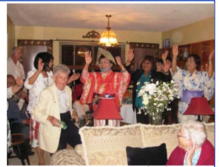
3. Solano County (16)