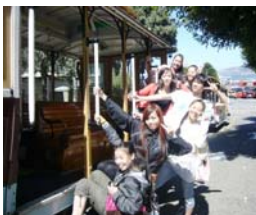
Extended stay in San Francisco