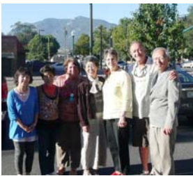
Colorado Springs Homestay

After the Summit, while some participants flew back to Japan directly from San Francisco, many of the Japanese participants departed for the Post Summit Optional Programs to explore the different cultures of other regions of America and make more friends.