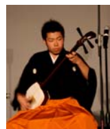
Tsugaru Shamisen Performance by Masato Shibata *