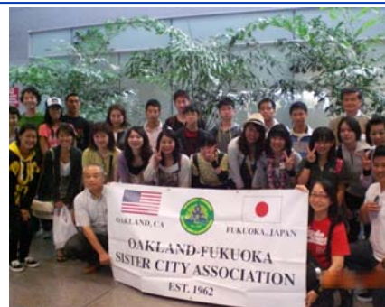
5. Alameda County (19)