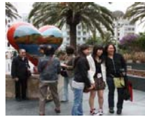
Union Square History and Shopping Tour

5 Local Tour options by knowledgeable local volunteers were offered to participants who choose areas they would like to visit. Around 40 people chose to stay in San Francisco for a lecture from journalist Fumio Matsuo.