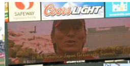
Video message from Hideki Matsui of LA Angeles