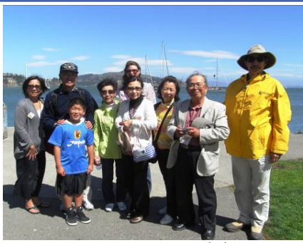
1. Marin County (9)

The Local Session program lasted 4 days and 3 nights in 11 different locations around the San Francisco Bay Area. (The number of Japanese participants are listed next to the Regions in brackets below)