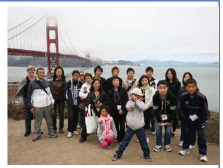
8-B. San Francisco County B (22)