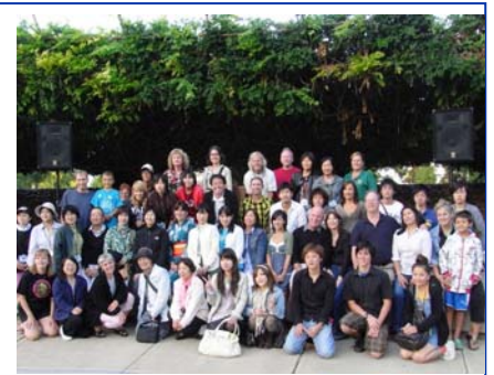
6. Santa Clara County (25)