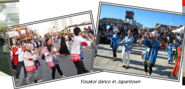
Yosakoi dance in Japantown