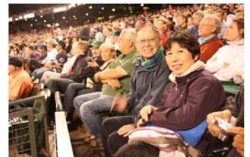
Seattle Mariners Game