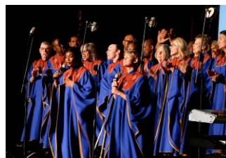
Glide Ensemble *