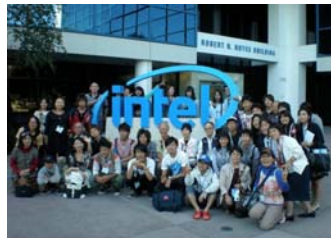
Silicon Valley Tour