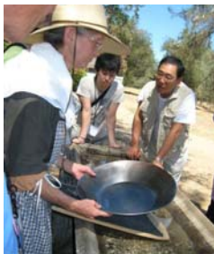
Gold Country Tour