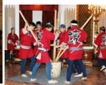
Rice pounding ceremony *