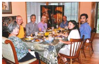
Washington DC Homestay