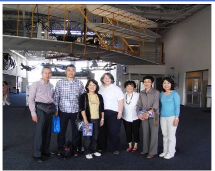
7. San Mateo County (7)