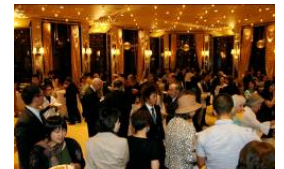
Welcome party *