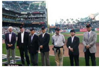
Members of the Summit on the field