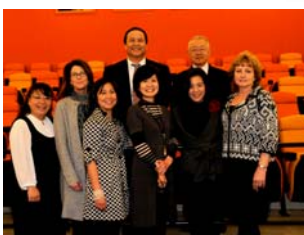
SBGS Executive Committee Members