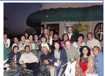
10. Napa County (10)