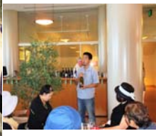
Wine Country Tour