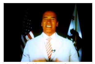
A video message from Governor Arnold Schwarzenegger *