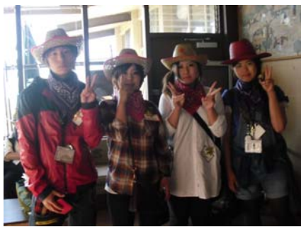
4. Contra Costa County (19)