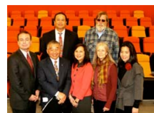
Local Tour Leaders