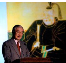
The 18 th Descendant of Tokugawa Shogunate Tsunenari Tokugawa *