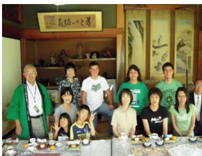
4. Minamisanriku Town (5)