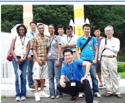
13. Kakuda City (6)