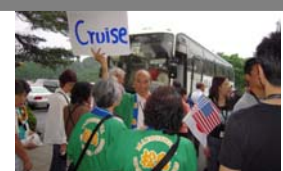
Boarding for a cruise around picturesque Matsushima

Despite arriving in Matsushima rather late the previous night, the American participants were able to enjoy local tours in Matsushima on the morning and afternoon of July 29 th , showing no signs of jet lag!