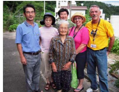
5. Naruko Area (Osaki City) (5)