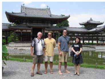
Kyoto & Tokyo