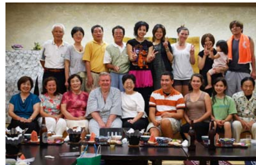
Visiting relatives in Mie