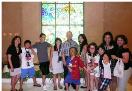
Tokyo Free Time

After the summit, while some participants flew back to America directly from Narita, many of them departed for the Post Summit Optional Programs to explore the different cultures of other regions of Japan and make more friends.