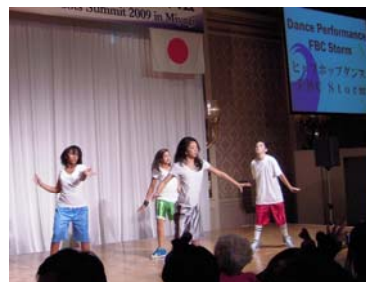
FBC STORM, a hip hop dance team