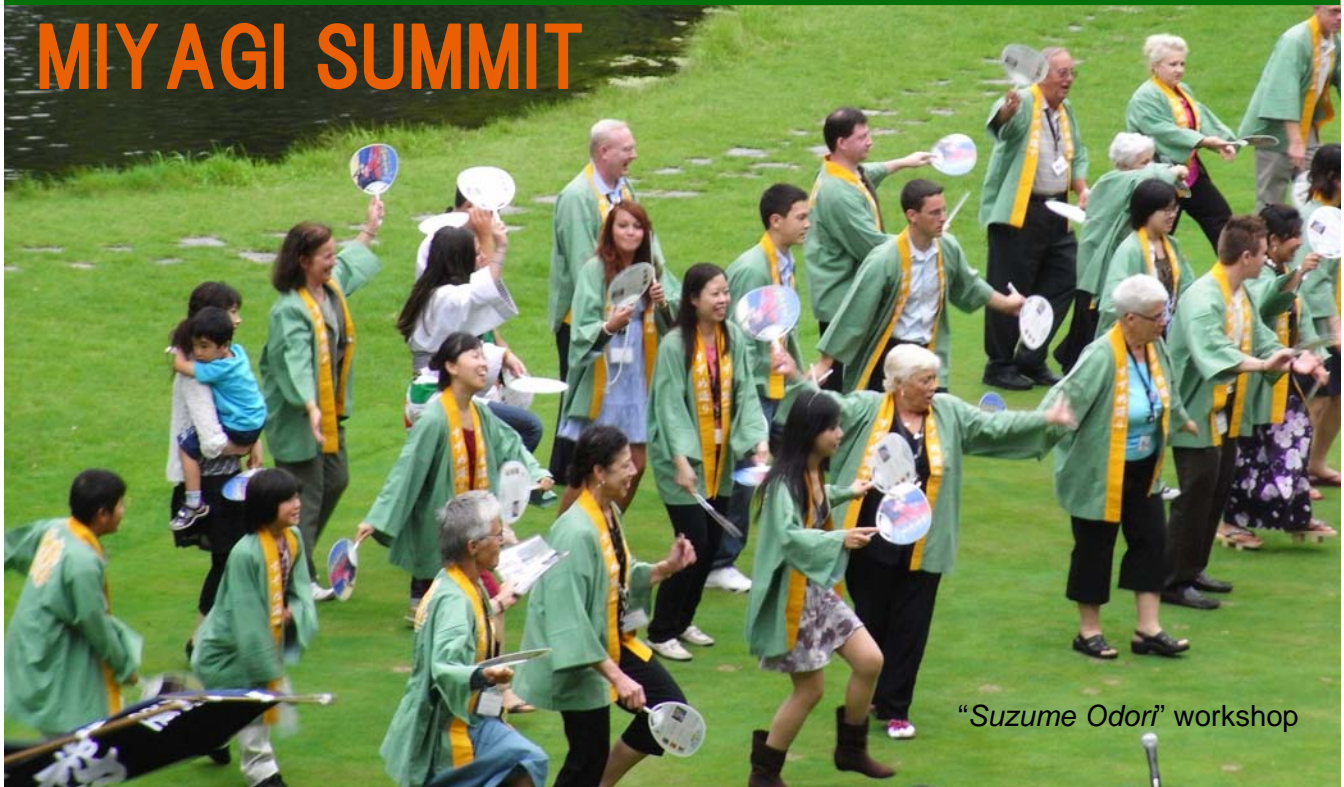
"Suzume Odori" workshop

From July 28th to August 2nd, the 19th America Japan Grassroots Summit in Miyagi was held in Miyagi, Japan. Despite the spread of swine flu and the greatest global recession for 100 years limiting international travel, about 100 participants traveled from America to Japan. Some comments from the participants include, "the volunteer committee members were so considerate and we enjoyed a very high quality programme" and "the summit was greater than we had ever imagined. We would like to thank all those who were involved in the organization of the summit.