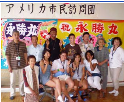
10. Sendai City (7)