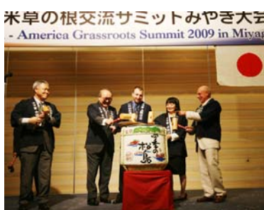
Sake barrel opening