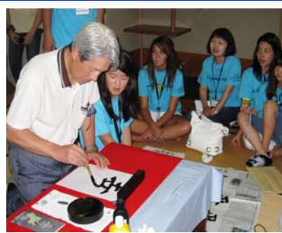
8. Ishinomaki City (11)