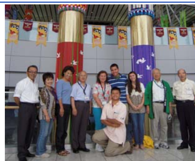
11. Iwanuma City (4)