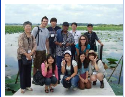
3. Kurihara City (5)