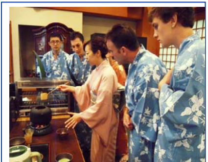
12. Zao Town (8)