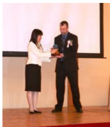
Exchange of globe between the two families