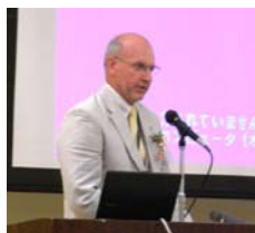
Matthew Perry, Descendant of Commodore Perry