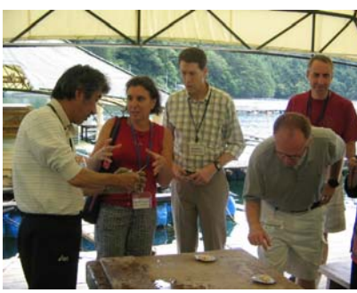
1. Kesenuma City (6)

On July 30 th , the Local Session Program started, lasting for 4 days and 3 nights in 15 areas. (The number of American participants can be found below in brackets)