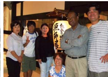
Noto & Tokyo