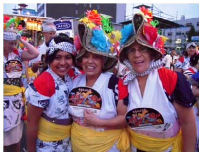
Tohoku Big Summer Festivals