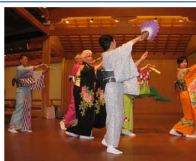
14. Shiroishi City (5)