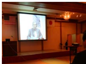
Video message by Dr. Shigeaki Hinohara