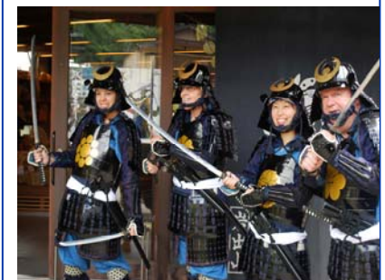
6. Furukawa Area (Osaki City) (4)