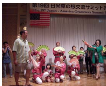
Surprise birthday celebration