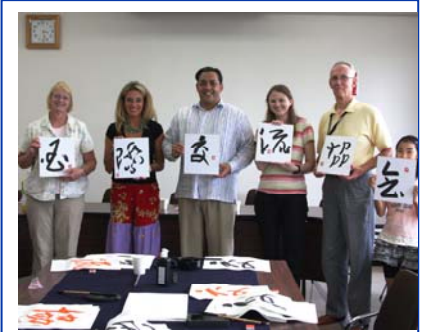
9. Matsushima and Shiogama (5)