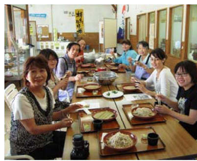
2. Tome City (4)