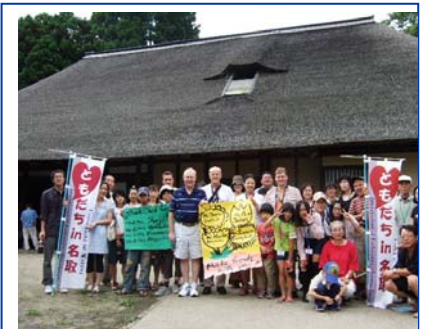
15. Natori City (4)