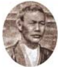
John Manjiro Nakahama