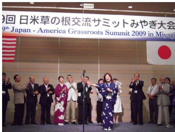
Key Persons in the Miyagi Summit 2009

Volunteer “ Key Persons ” are appointed to manage “local sessions” in various locations within the summit region (about 10 cities or towns). The local session includes a program of locally organized activities as well home stays. Key Persons represent their region during the Summit, recruit and coordinate host families and plan and carry out local activities.