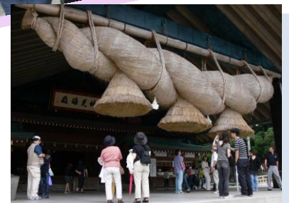
Izumo Taisha Grand Shrine