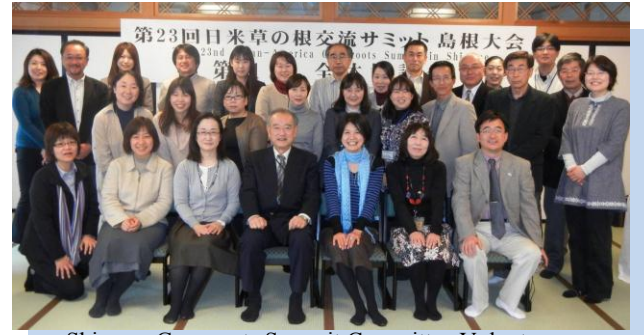
Shimane Grassroots Summit Committee Volunteers

The Grassroots Summit will be held in various locations throughout SHIMANE. The key persons and volunteers of the cities and towns are busy preparing to welcome their American guests next summer. They are all looking forward to meeting and making lasting a friendship with you!!