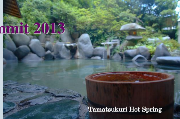
Tamatsukuri Hot Spring