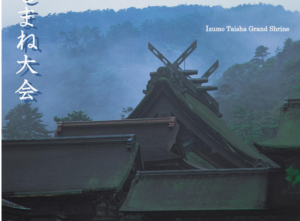
Izumo Taisha Grand Shrine