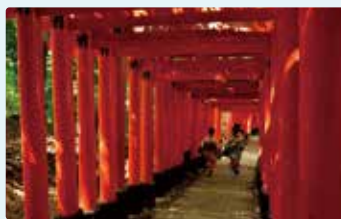
Fushimi Inari Shrine

July 15 Depart Wakayama City for Kyoto (Mon.) [ Stay at Ibis style Kyoto station Hotel ]