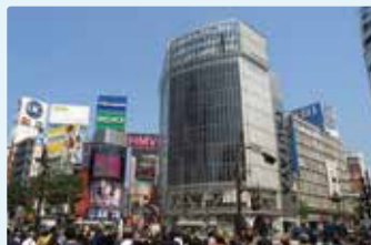
Shibuya Scramble Crossing