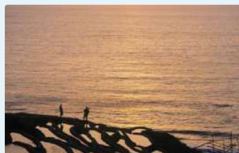
Shiroiyone Rice Fields in Noto