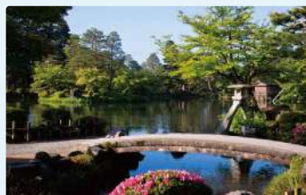
Kanazawa Kenrokuen Garden

Participation fee includes all transportation from Wakayama to Kyoto and Tokyo, admission to Gion Corner and selected Kyoto monuments, and hotel room and breakfast in Tokyo. Host family serves you meals when you are at their home. The Tokyo portion does not include a guide or personal transportation. Fees based on double occupancy of the hotel room in Tokyo. If you prefer a single room, add $95.